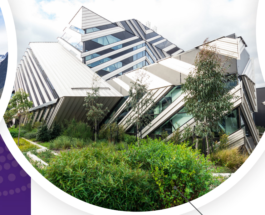
Monash University, Melbourne, Australia*