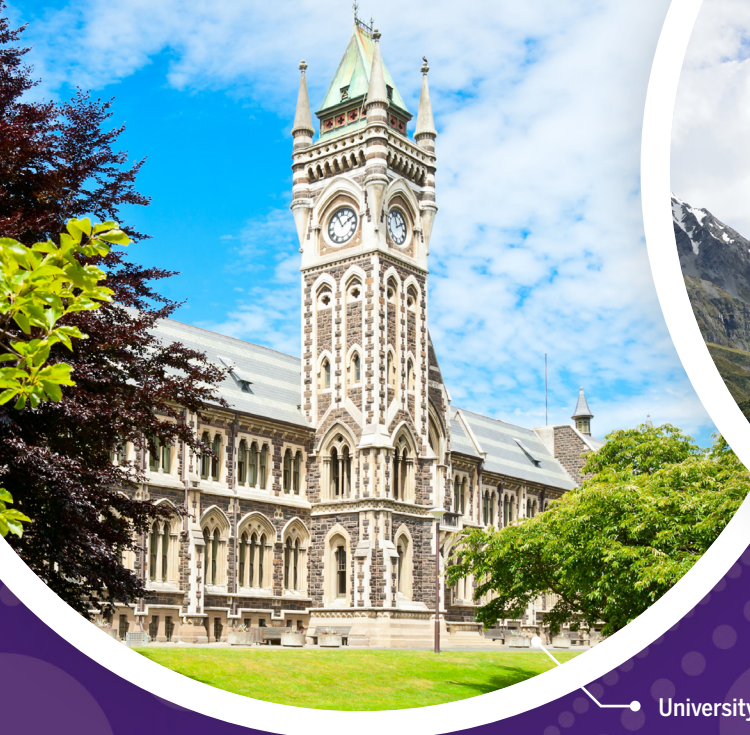
University of Otago, Dunedin, New Zealand*